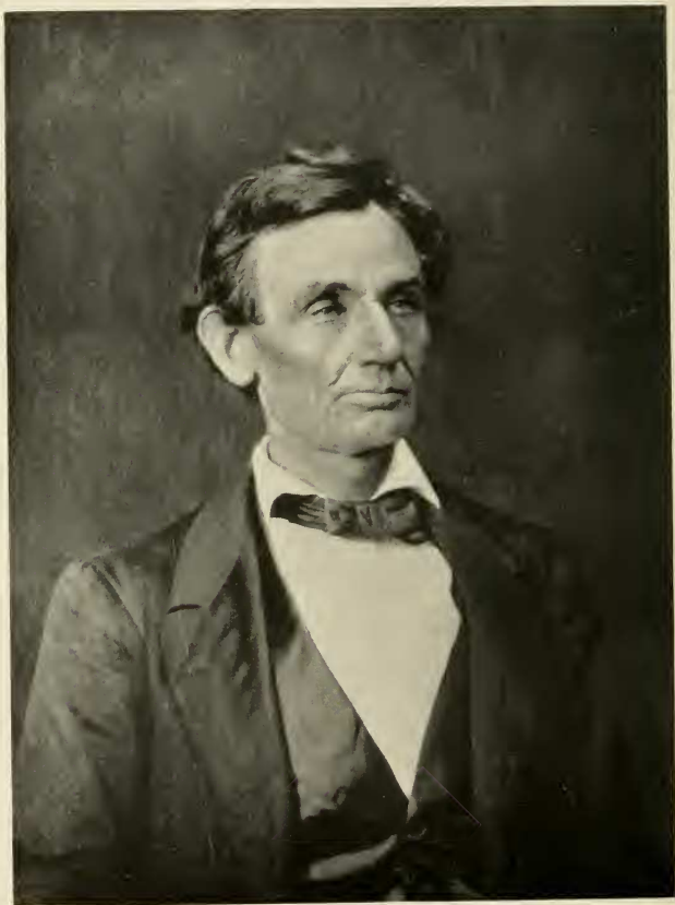
RETOUCHED PRINT FROM NEGATIVE SHOWN IN PLATE 2